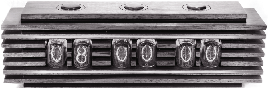
Lamina Simplon Nixie Clock